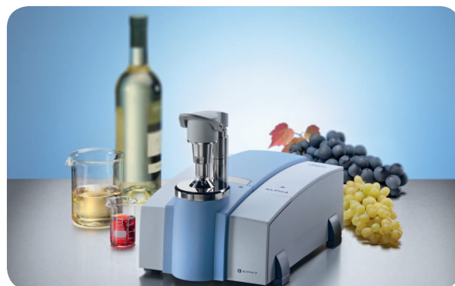
Figure 1: ALPHA-P wine-analyzer with flow through cell

The wine-sample is analyzed by utilizing the so called ATR measurement technique. The robust ATR diamond crystal allows measurements without sample preparation and guarantees precise and reproducible analysis results.